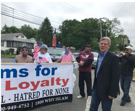
Congressman Frank Palone