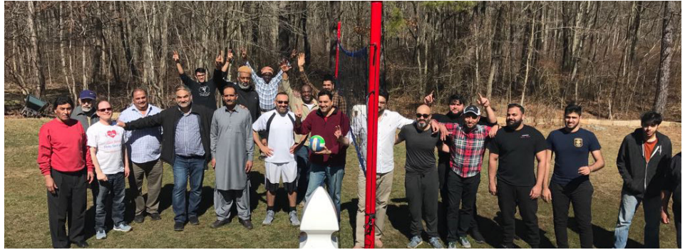
Ansar Khuddam Volleyball game

Regional Ijtimaa for Majlis Ansarullah Central-East was held at Baitul Hadi mosque May 12, 2018. The event was very insightful and spiritually uplifting.