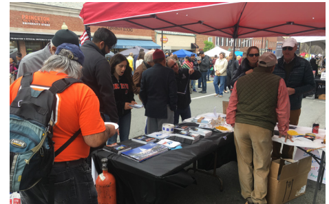
Visitors at the Jamaat stall, as pictured above.

that people can take away with our Masjid and contact info. Inshallah these efforts will bear fruit. Jazakallah to all of those who helped make it a positive event.