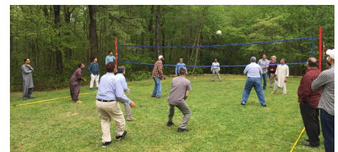
Ansar volley ball match